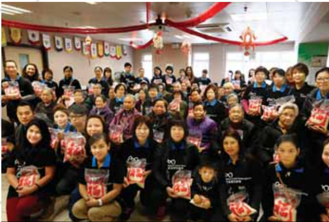
Melco Crown Entertainment is keen on making differences in people's lives and encouraging volunteerism among its colleagues.