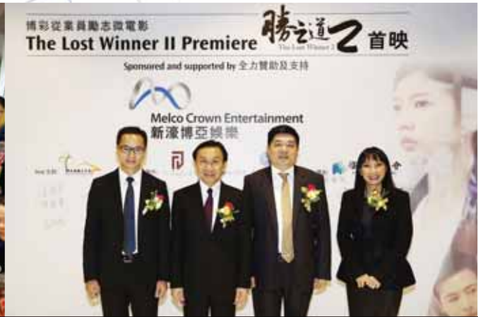
Melco Crown Entertainment supports a local microfilm project that conveys positive image of the gaming industry and inculcates a positive outlook and values by the employees of the industry.