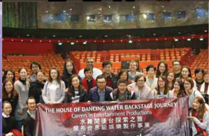
Focusing heavily on the development of local Macau talents, Melco Crown Entertainment inspires students to pursue education and future career in creative and entertainment production through a backstage tour of the world's largest water-based extravaganza, The House of Dancing Water.