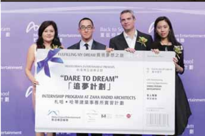
The Company's "Dare to Dream" signature series has brought world-renowned artists and experts to Macau, offering local talents exposure and opportunities to study with the best of the best in different fields.