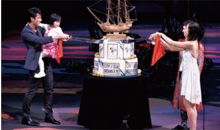
Since its debut four years prior, The House of Dancing Water has garnered a growing international reputation as one of the world's most awe-inspiring productions.

In the rolling chip market segment, customers purchase identifiable chips known as non-negotiable chips, or rolling chips, from the casino cage, and there is no deposit into a gaming table's drop box of rolling chips purchased from the cage. Rolling chip volume and mass market table games drop are not equivalent. Rolling chip volume is a measure of amounts wagered and lost. Mass market table games drop measures buy in. Rolling chip volume is generally substantially higher than mass market table games drop. As these volumes are the denominator used in calculating win rate or hold percentage, with the same use of gaming win as the numerator, the win rate is generally lower in the rolling chip market segment than the hold percentage in the mass market table games segment.