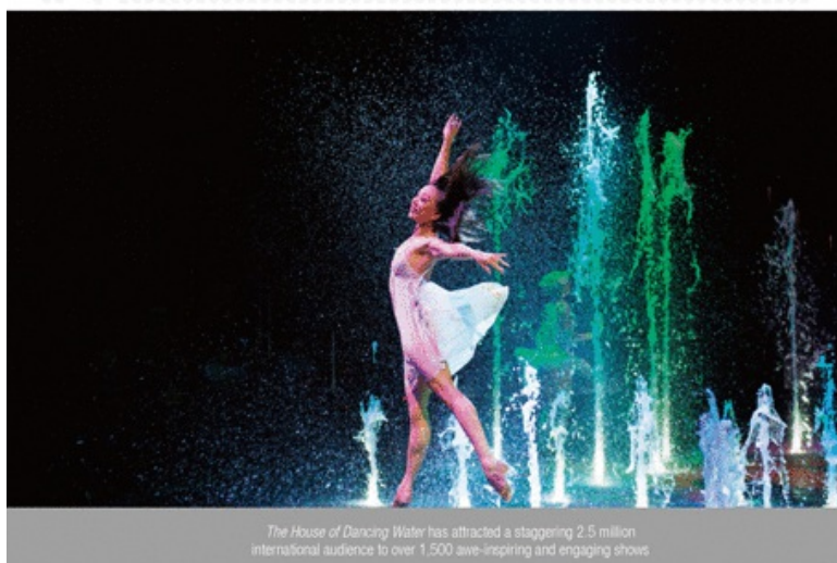
The House of Dancing Water has attracted a staggering 2.5 million international audience to over 1,500 awe-inspiring and engaging shows