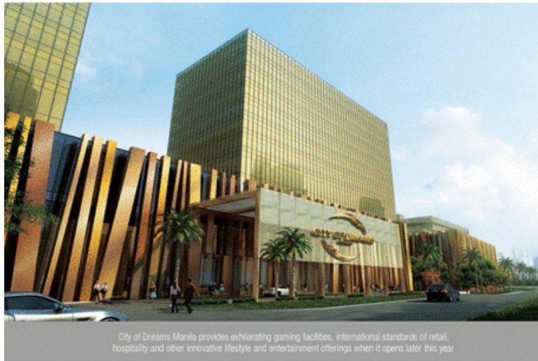
City of Dreams Manila provides exhilarating gaming facilities, international standards of retail, hospitality and other innovative lifestyle and entertainment offerings when it opens later this year

The Board has approved the implementation of a US$500 million stock repurchase program in August 2014 which, together with the Company's dividend policy, provides us with another mechanism to return surplus capital efficiently while retaining a flexibility to fund our current operations and future development pipeline.