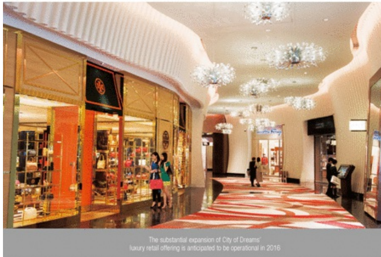
The substantial expansion of City of Dreams' luxury retail offering is anticipated to be operational in 2016

Operating cash flows are generally affected by changes in operating income and accounts receivable with VIP table games play and hotel operations conducted on a cash and credit basis and the remainder of the business including mass market table games play, gaming machine play, food and beverage, and entertainment are conducted primarily on a cash basis.