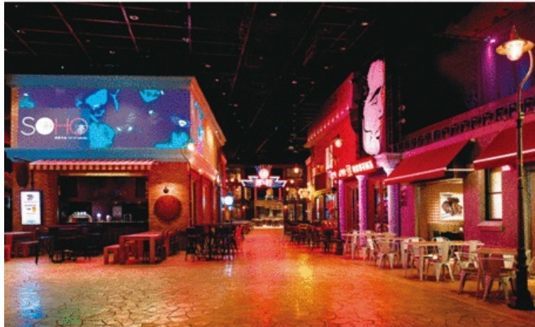
Featuring 16 restaurants and bars and daily live performances, SOHO at City of Dreams delivers innovative entertainment and amazing dining experiences in a cool urban environment

Income tax expense for the six months ended June 30, 2014 was primarily attributable to the Macau Complementary Tax of US$2.6 million on gain on disposal of assets held for sale and a lump sum tax payable of US$1.4 million in lieu of Macau Complementary Tax otherwise due by Melco Crown Macau's shareholders for dividends distributable to them by Melco Crown Macau, partially offset by deferred tax credit of US$1.9 million. The effective tax rate for the six months ended June 30, 2014 was 0.8%, as compared to a negative rate of 0.7% for the six months ended June 30, 2013. Such rates for the six months ended June 30, 2014 and 2013 differ from the statutory Macau Complementary Tax rate of 12% primarily due to the effect of change in valuation allowance, expenses for which no income tax benefit is receivable for the six months ended June 30, 2014 and 2013 and the effect of a tax holiday of US$60.7 million and US$58.4 million on the net income of our Macau gaming operations during the six months ended June 30, 2014 and 2013, respectively, which is set to expire in 2016. Our management does not expect to realize a significant income tax benefit related to deferred tax assets generated by our Macau operations; however, to the extent that the financial results of our Macau operations improve and it becomes more likely than not that the deferred tax assets are realizable, we will be able to reduce the valuation allowance through earnings.