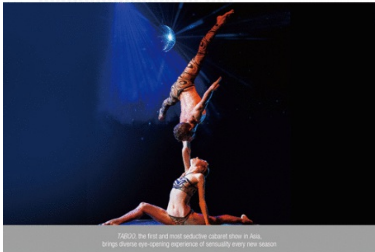
TABOO, the first and most seductive cabaret show in Asia, brings diverse eye-opening experience of sensuality every new season

Food, beverage and others. Other non-casino revenues (including the retail value of promotional allowances) for the six months ended June 30, 2014 included food and beverage revenues of US$40.6 million and entertainment, retail and other revenues of US$53.0 million. Other non-casino revenues (including the retail value of promotional allowances) for the six months ended June 30, 2013 included food and beverage revenues of US$37.9 million, and entertainment, retail and other revenues of US$45.9 million. The increase of US$9.8 million in food, beverage and other revenues from the six months ended June 30, 2013 to the six months ended June 30, 2014 was primarily due to higher business volumes associated with an increase in visitation during the period, as well as the improved yield of rental income at City of Dreams.