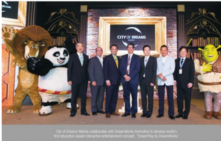
City of Dreams Manila collaborates with DreamWorks Animation to develop world's first education-based interactive entertainment concept, "DreamPlay by DreamWorks"

Our subsidiary, MCE Leisure Philippines, has been cooperating with SM Group's Belle Corporation (" Belle ") to develop City of Dreams Manila. The cooperation in development involves the provision of the land and building structures by Belle and the fitting out of the buildings by MCE Leisure Philippines. MCE Leisure Philippines will solely manage and operate City of Dreams Manila upon its opening. MCE Leisure Philippines is required to pay rent for the land and building structures to Belle pursuant to a lease agreement, and is also responsible under the cooperation arrangement to pay monthly payments, based on the performance of gaming operations of City of Dreams Manila, to the Philippine Parties. MCE Leisure Philippines shall be entitled to retain all revenues from non-gaming operations of City of Dreams Manila.