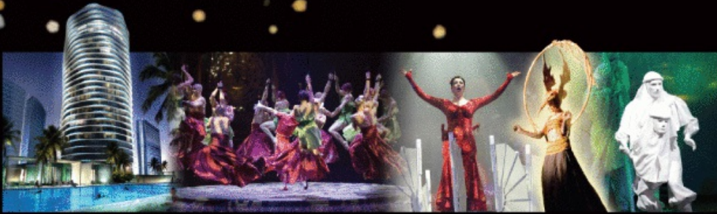
City of Dreams